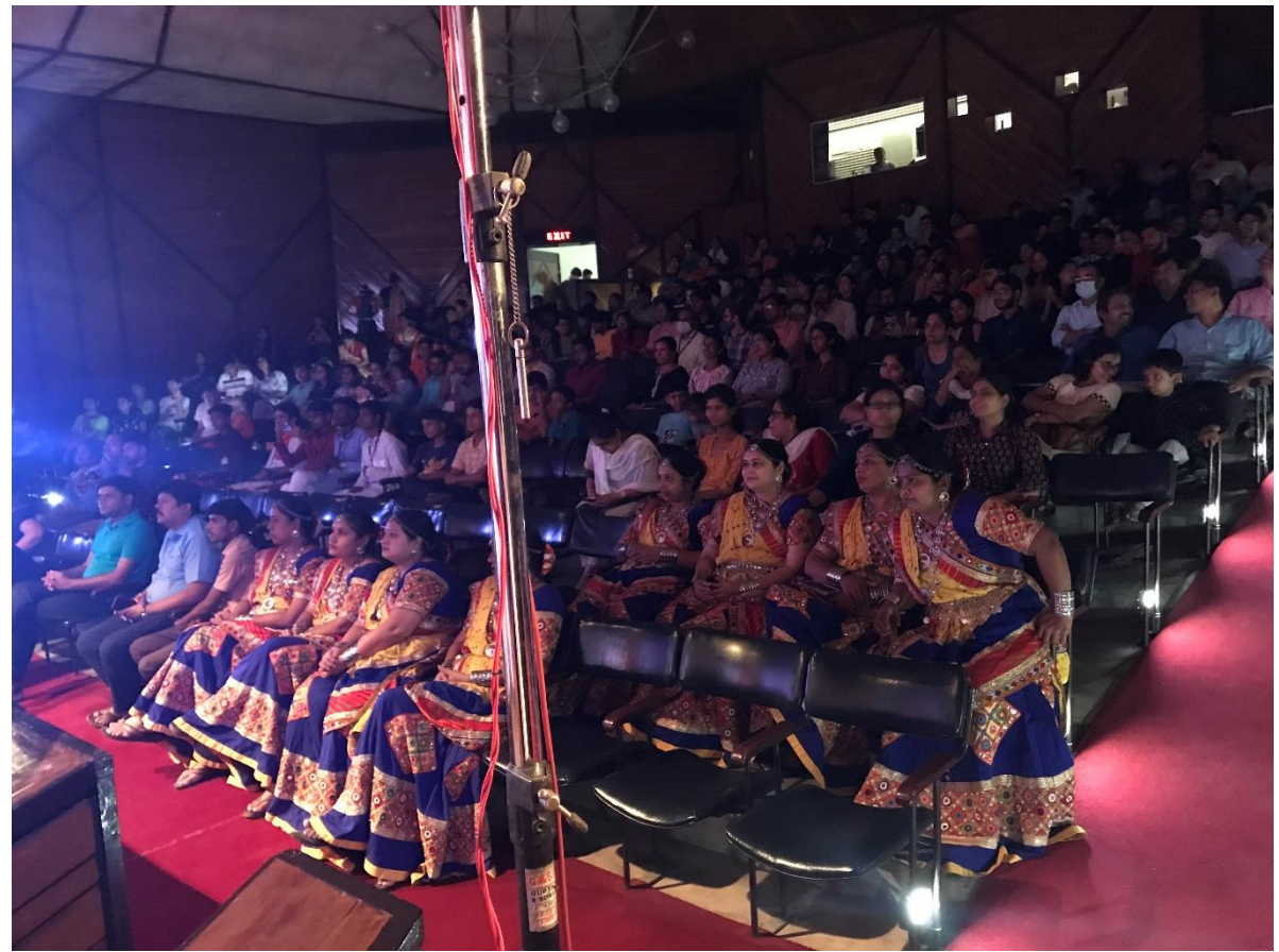
IRMA Auditorium during the Cultural Programme