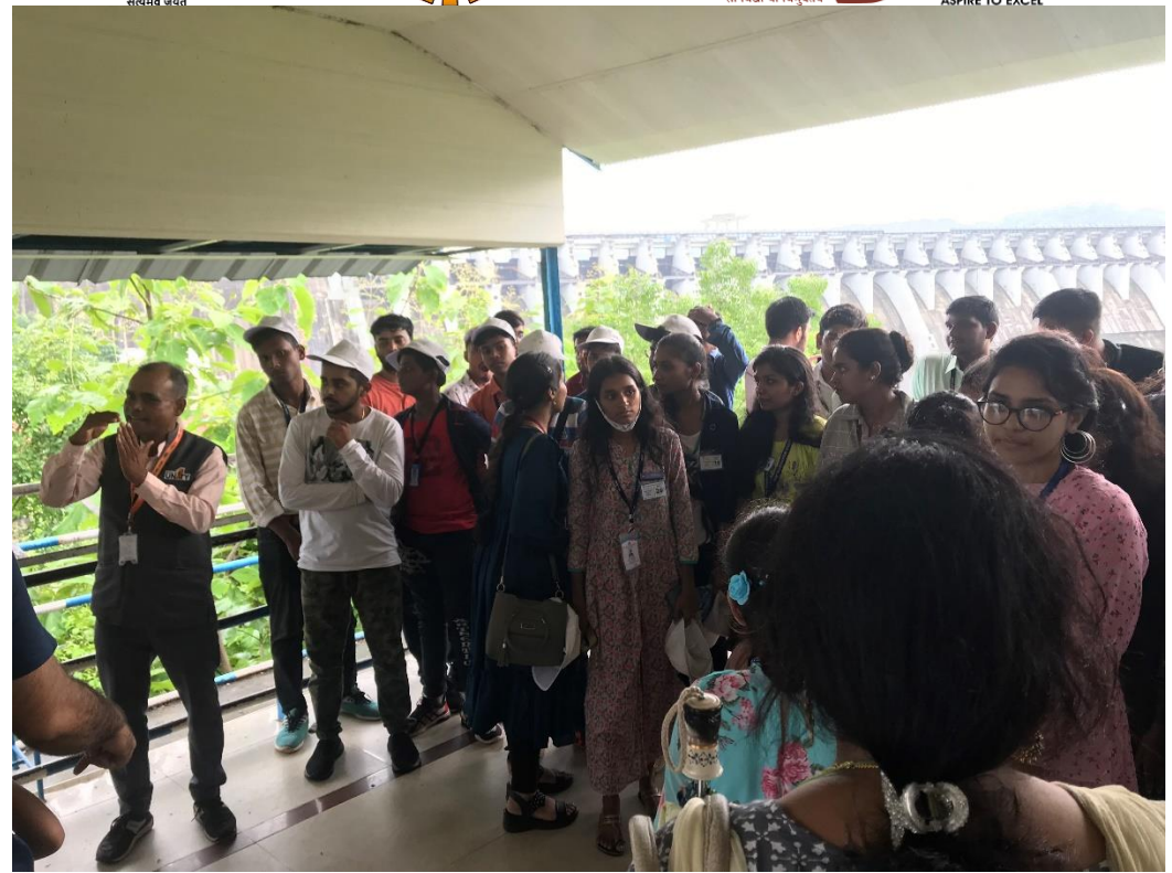
At Sardar Sarovar Dam