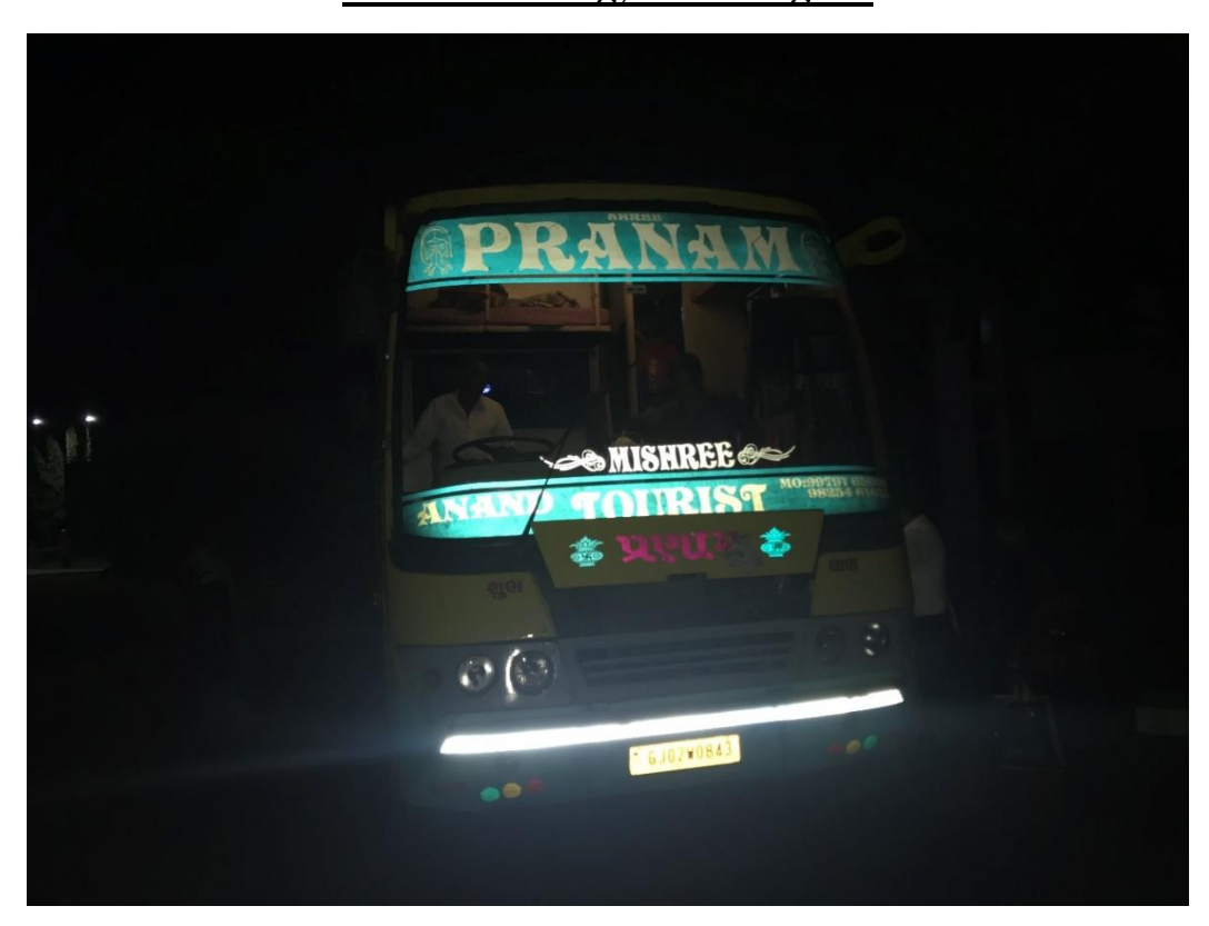
Way to Anand Railway Station