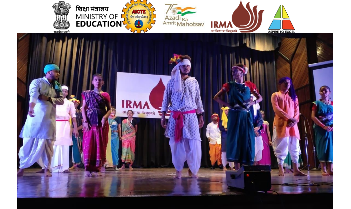
Cultural Programme – Performance by Students of Chhattisgarh