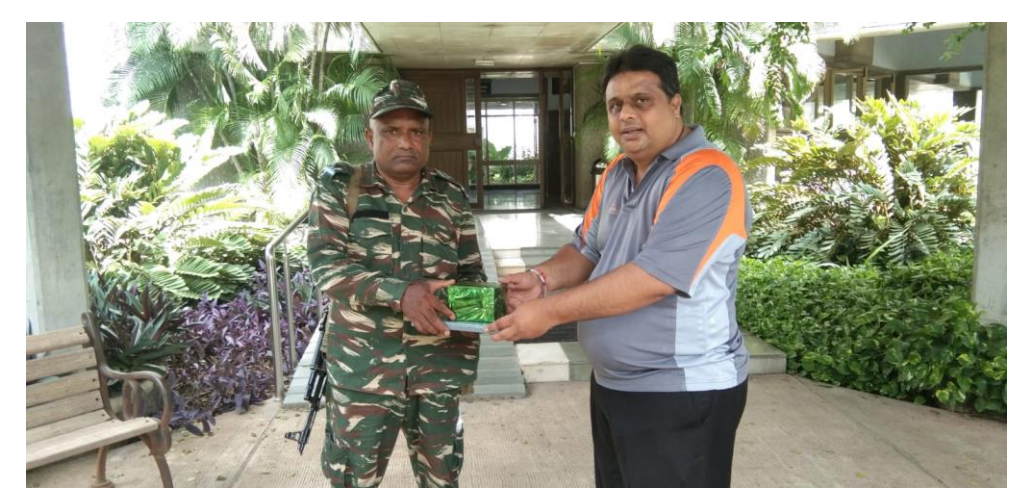
Memento to CRPF guards

Memento was given to each student of Chhattisgarh