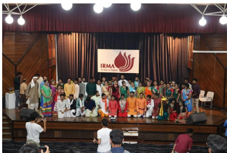
Chhattisgarh team after Cultrual Programme in IRMA Auditorium