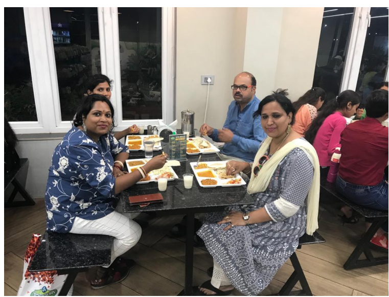
Lunch at Statue of Unity