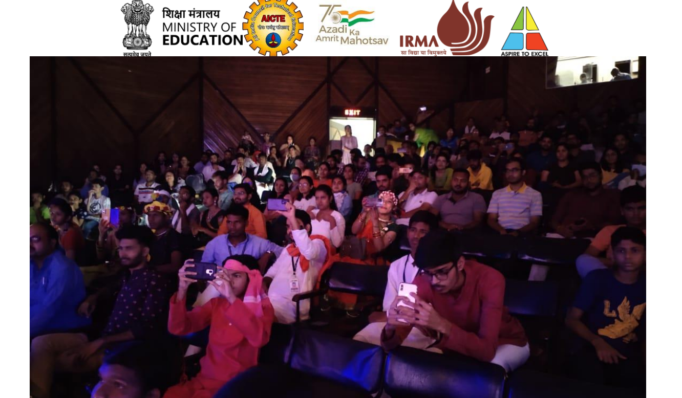
IRMA Auditorium during the Cultural Programme