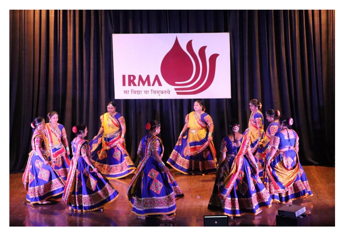
Cultural Programme – Performance by IRMA Community Members