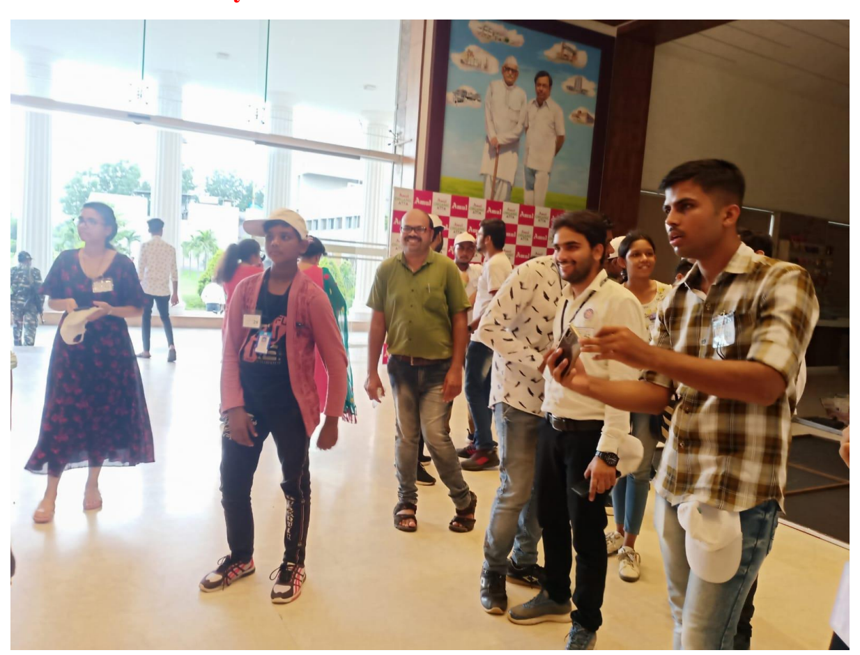
Visit at AMUL Chocolate Plant - Mogar