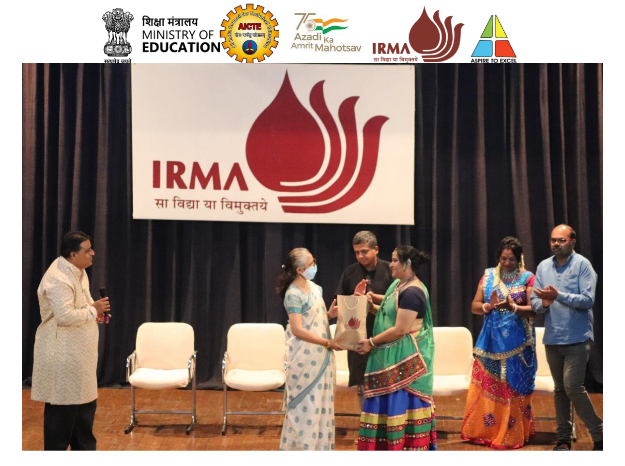
Memento from IRMA to Faculty of Bhilai Institute of Technology