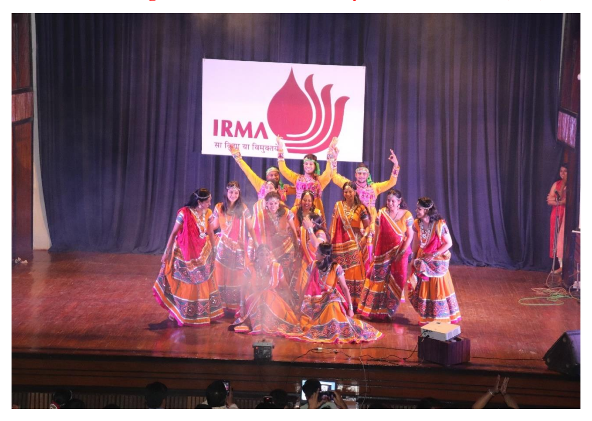
Cultural Programme – Performance by Students PGDM (RM)