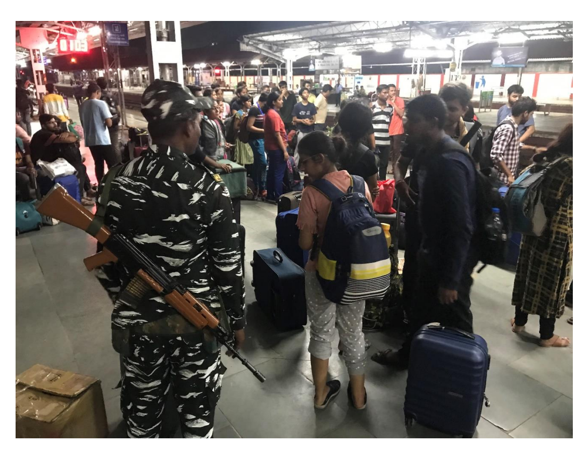
at Anand Railway Station