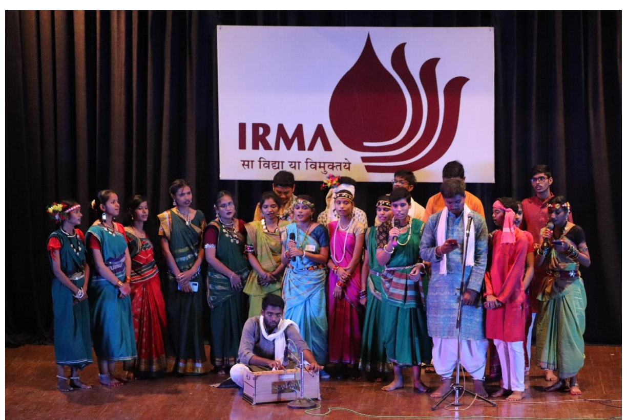
Cultural Programme – Performance by Students of Chhattisgarh