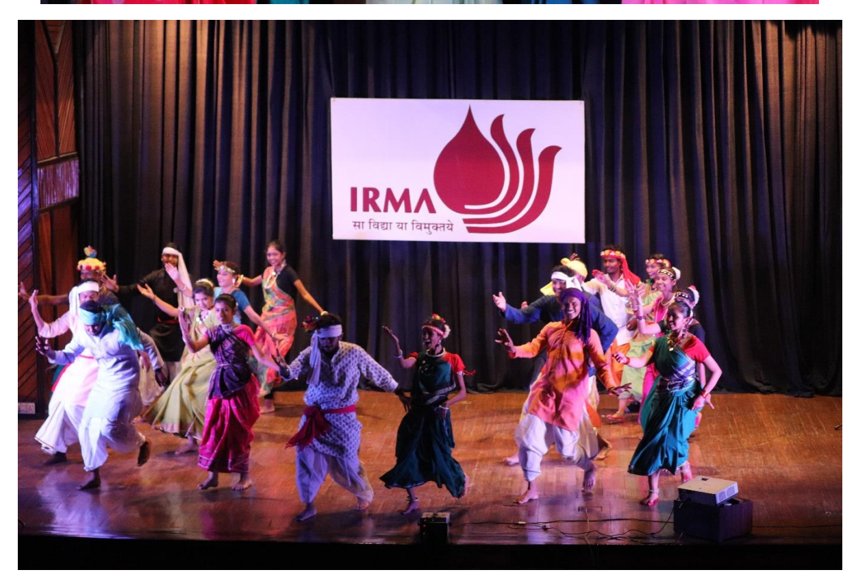
Cultural Programme – Performance by Students of Chhattisgarh