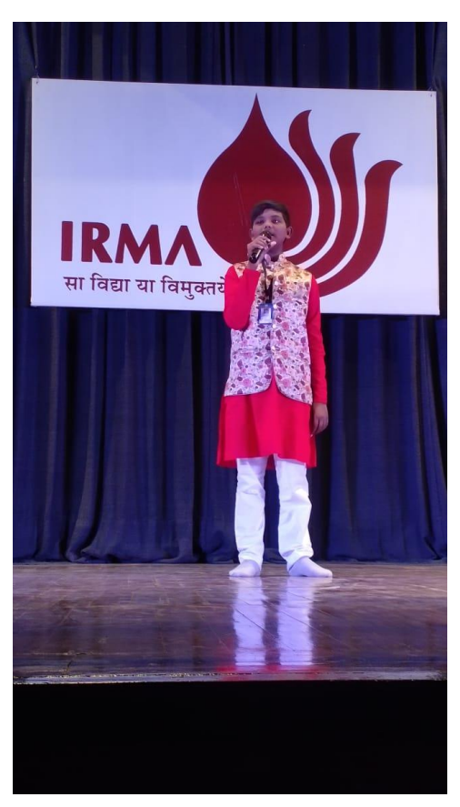
Cultural Programme – Performance by Students of Chhattisgarh