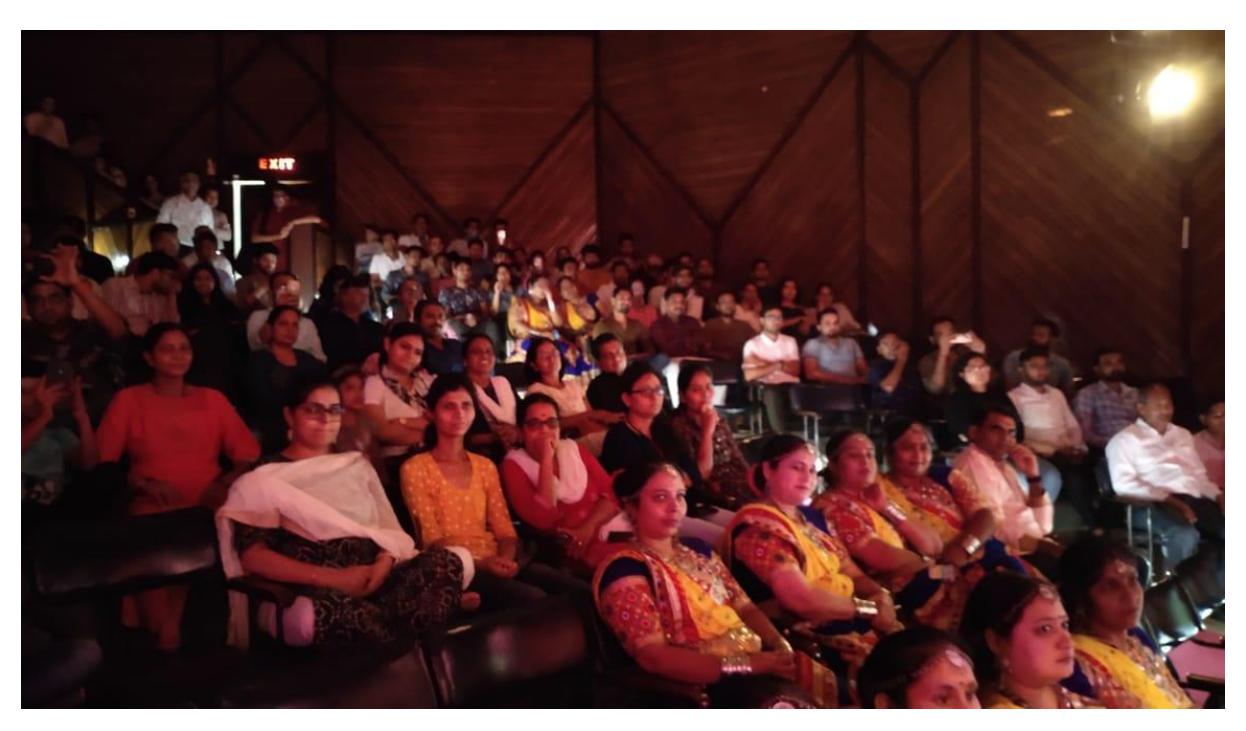
IRMA Auditorium during the Cultural Programme