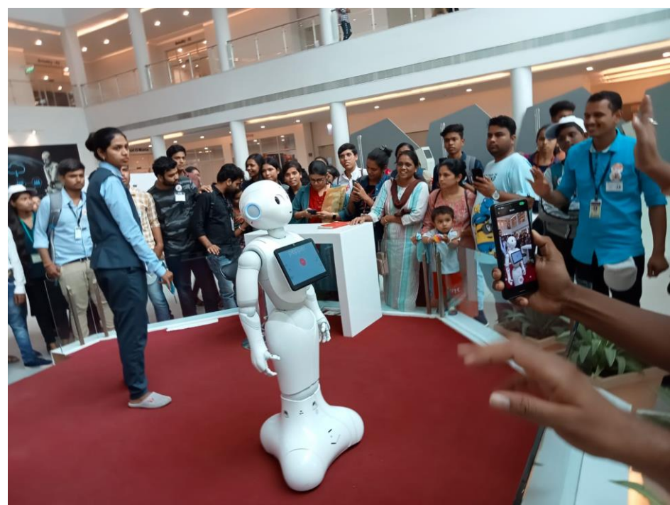
Science City - Ahmedabad