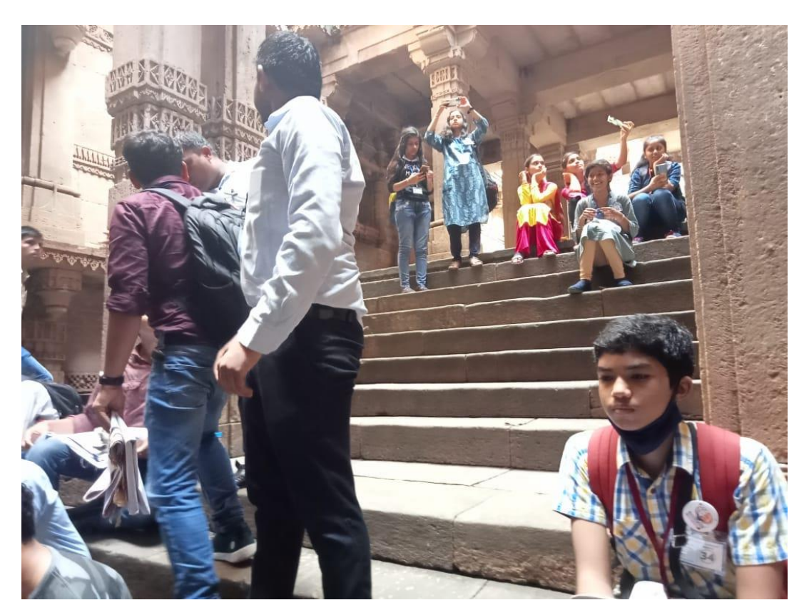
Adalaj Vav - Ahmedabad