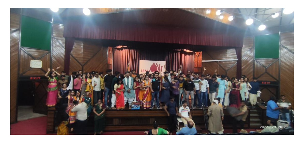
After Cultural Programme Students of IRMA and Chhattisgarh