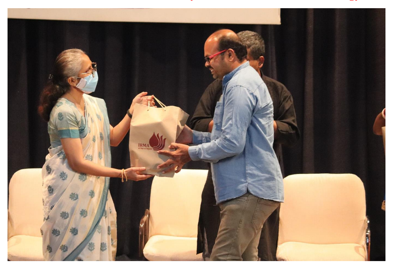
Memento from IRMA to Faculty of Bhilai Institute of Technology