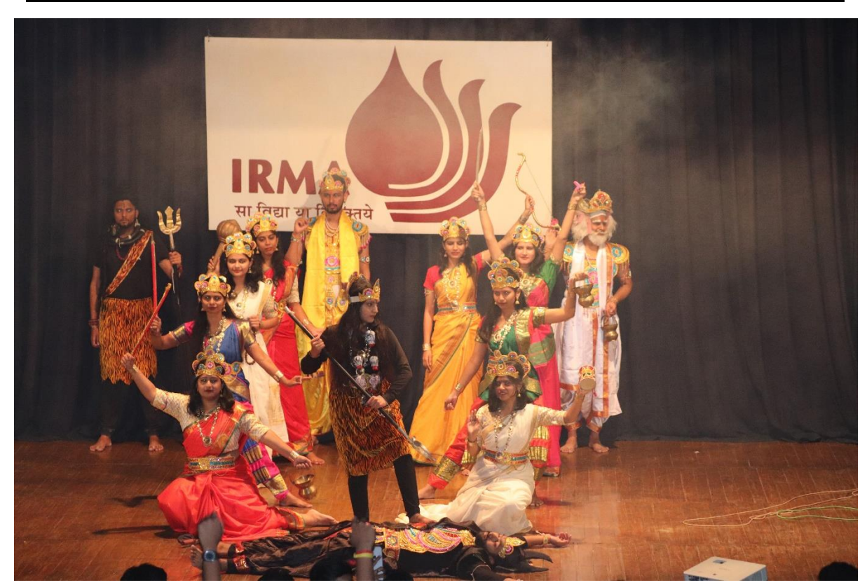
Cultural Programme – Performance by Students PGDM (RM)