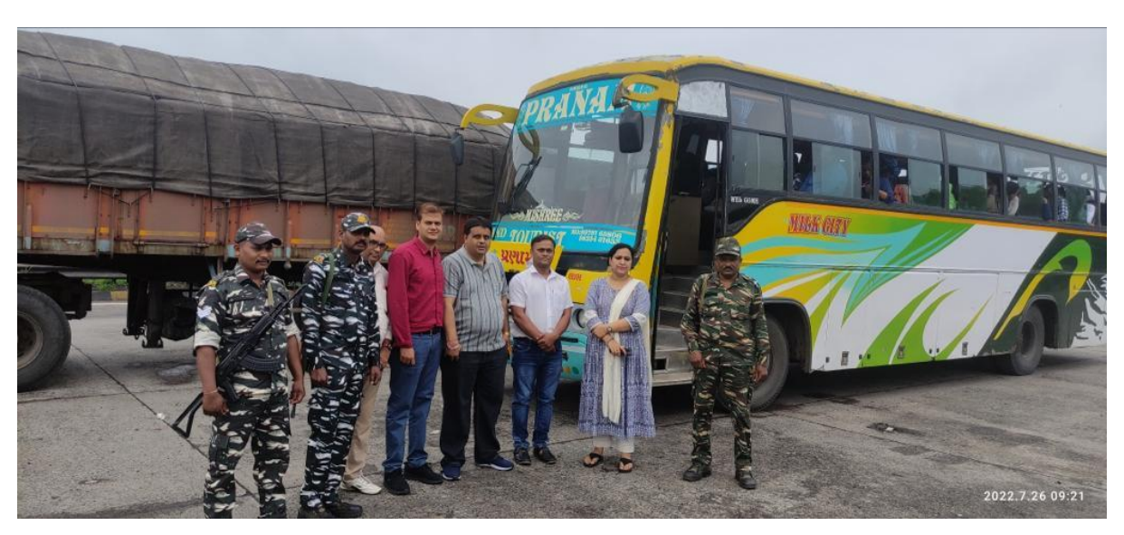
CRPF Cammandos join us from Vadodara