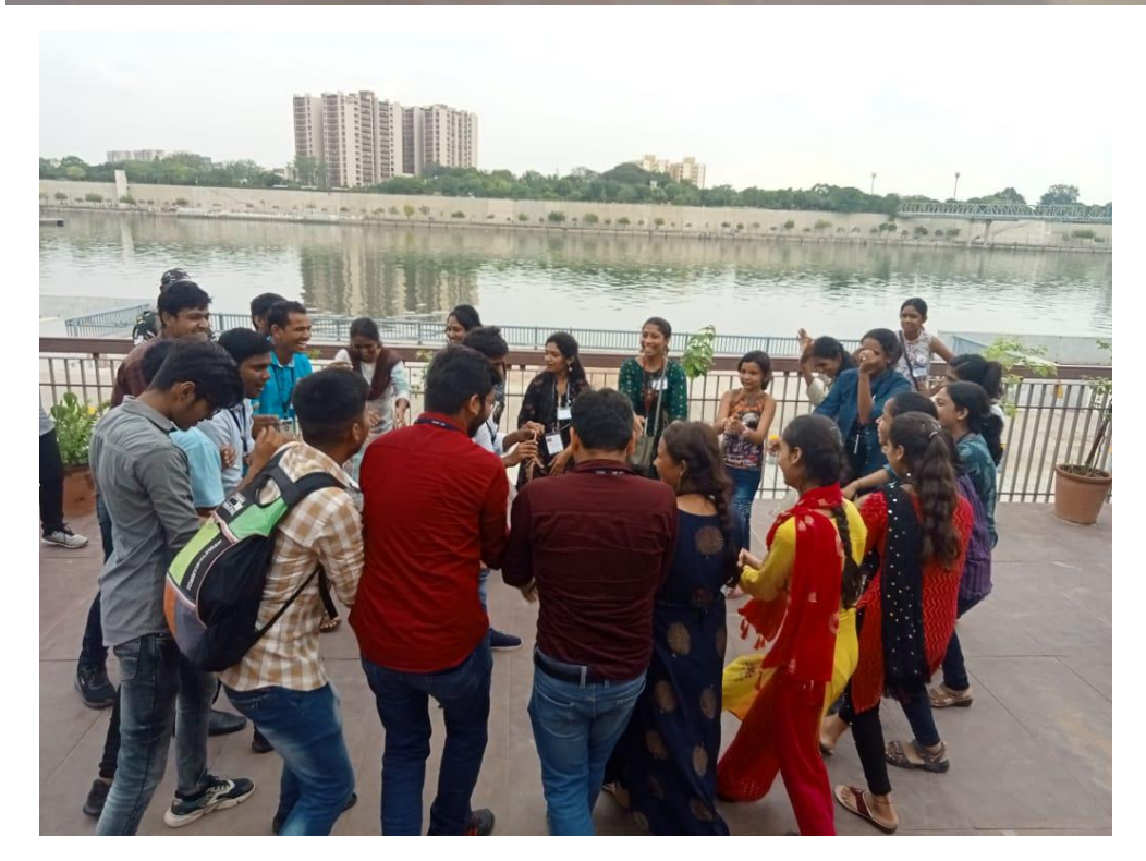
River Front - Ahmedabad