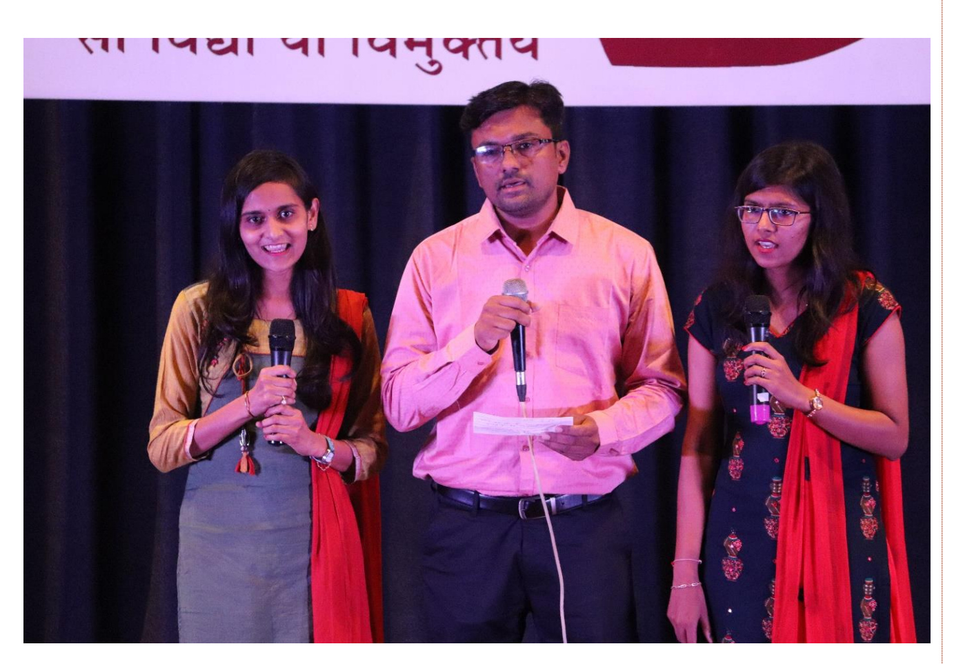
Cultural Programme – Prayer by PGDM (RM-X) Students