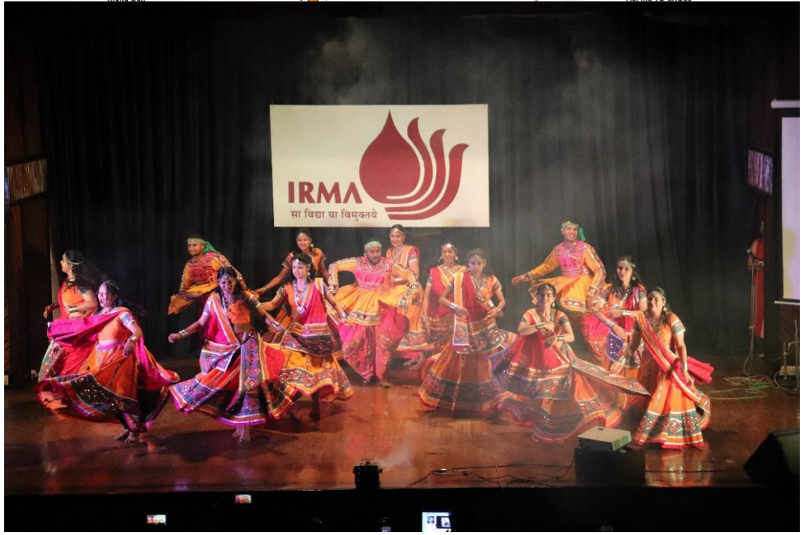
Cultural Programme – Performance by Students PGDM (RM)