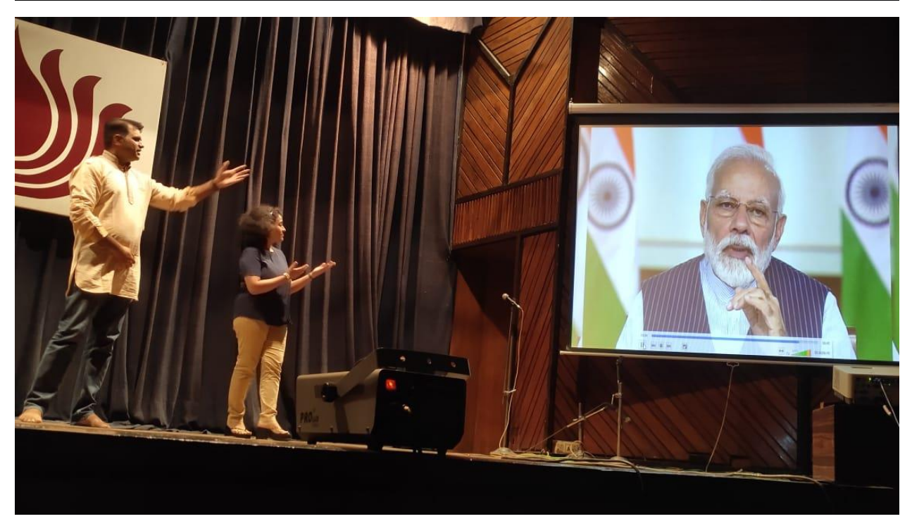
Cultural Programme – Performance by students of PGDM (RM-X)