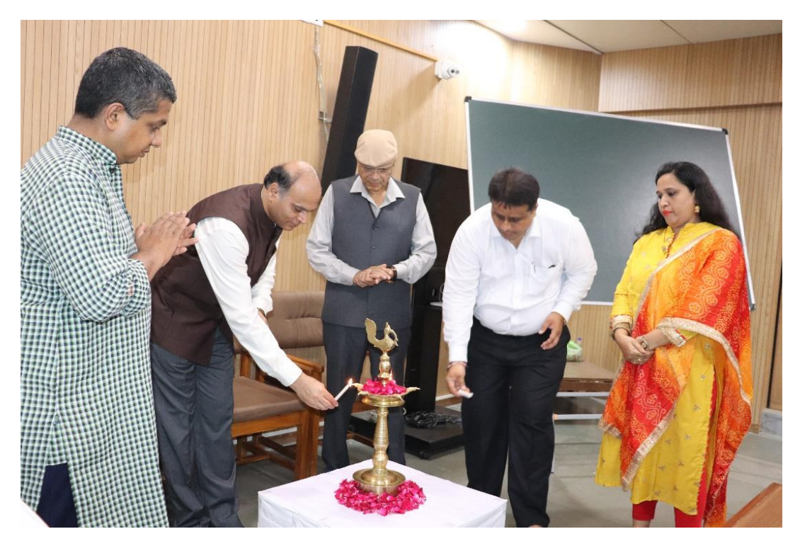
Lighting Lamp by dignities of the function