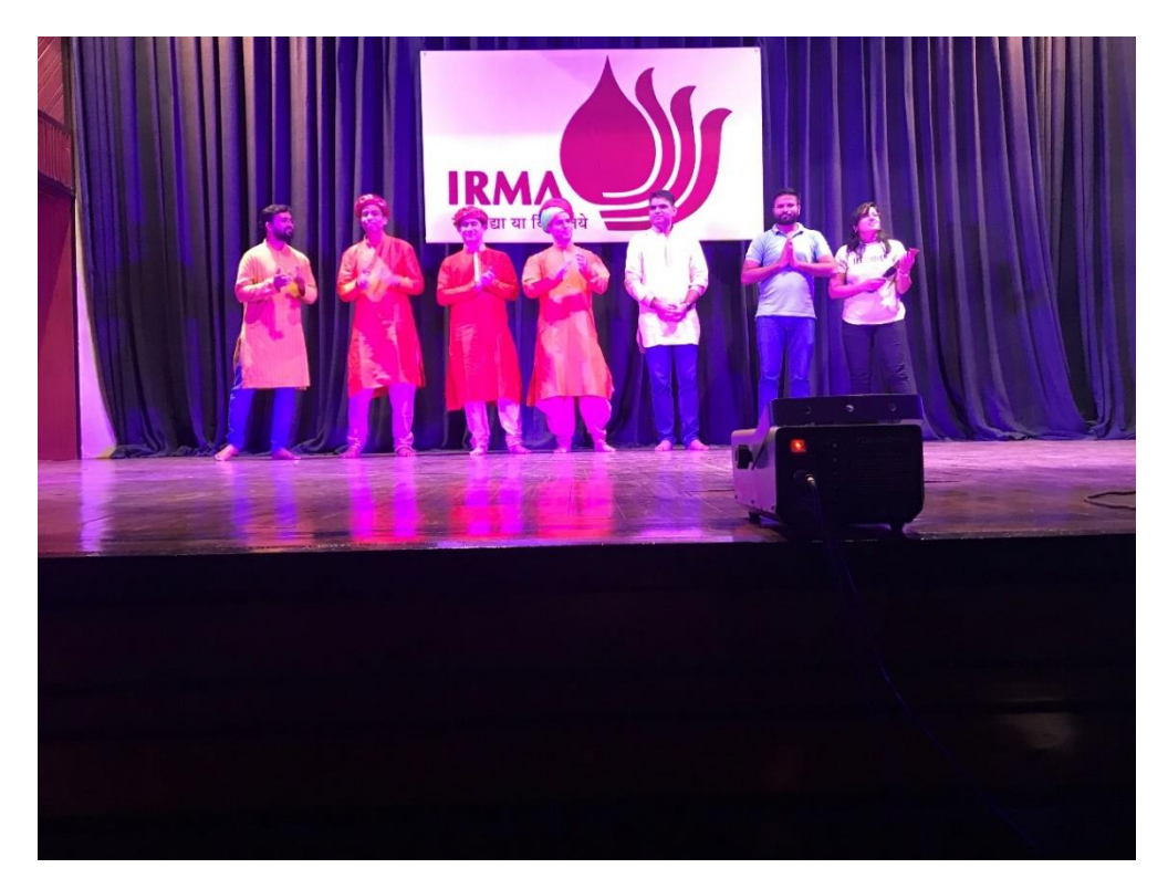
Cultural Programme – Performance by students of PGDM (RM-X)