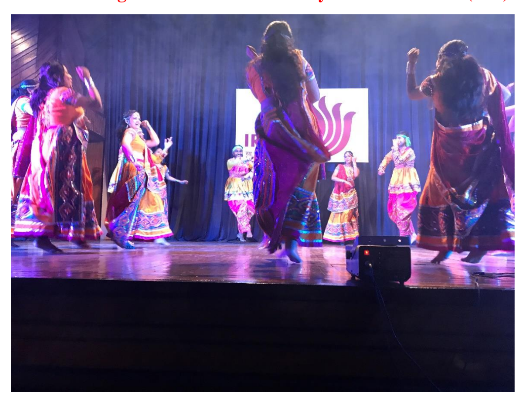
Cultural Programme – Performance by Students PGDM (RM)