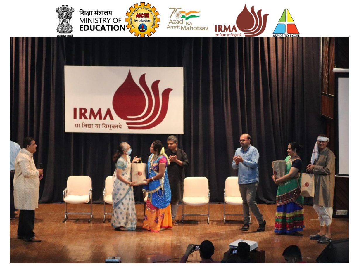
Memento from IRMA to Faculty of Bhilai Institute of Technology