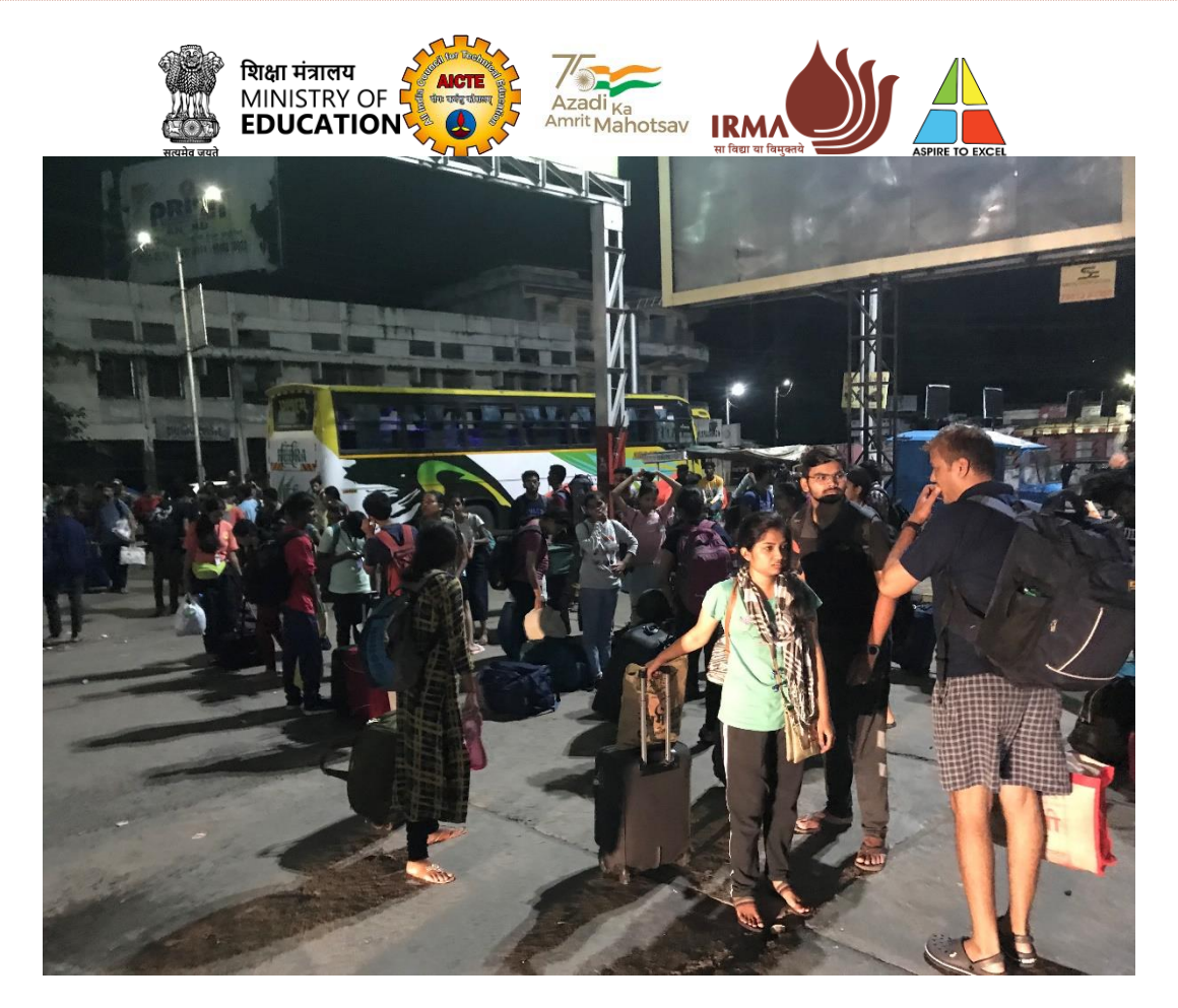
Chhattisgarh team at Anand Railway Station