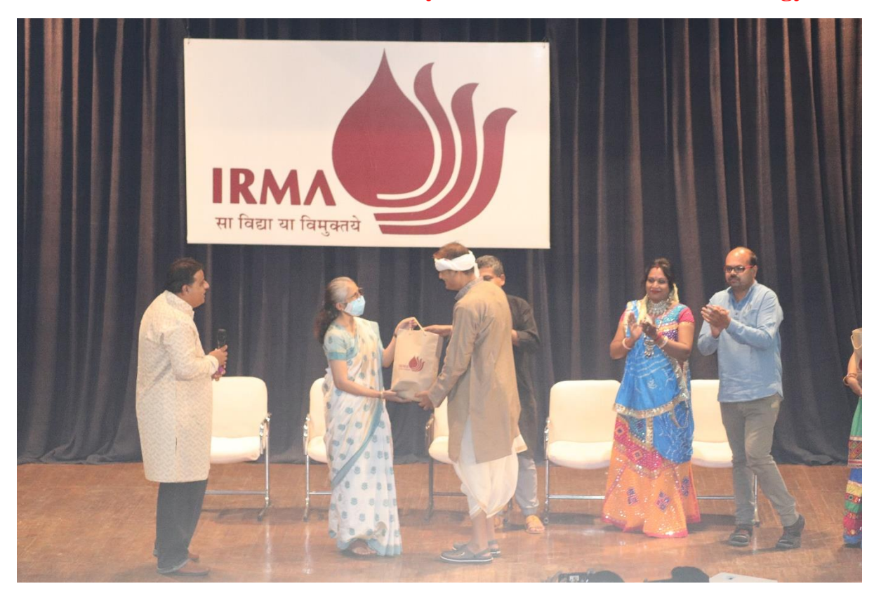
Memento from IRMA to Faculty of Bhilai Institute of Technology