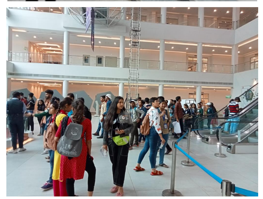
Science City - Ahmedabad