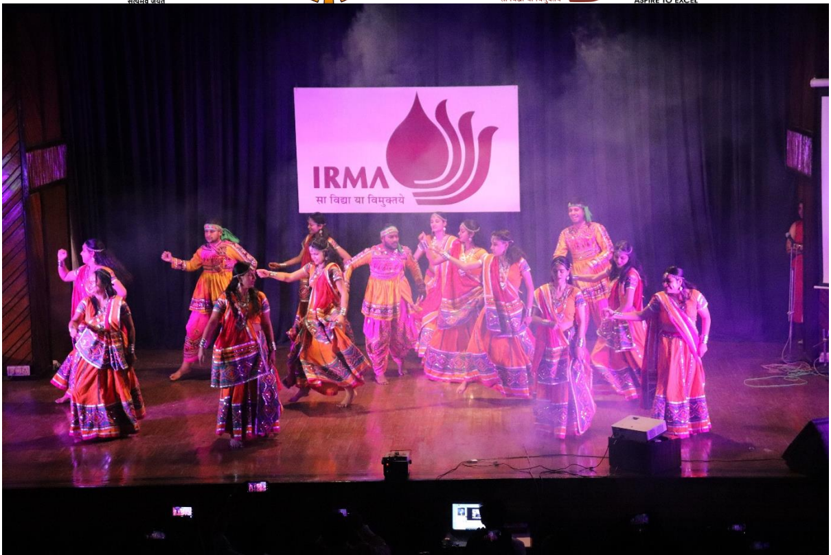
Cultural Programme – Performance by Students PGDM (RM)