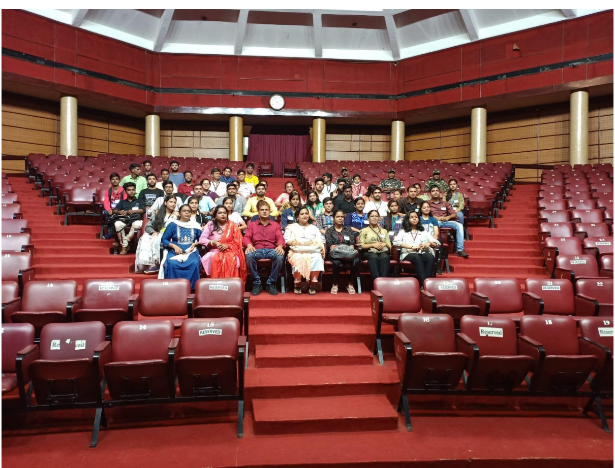
Visit at Tribhuvandas foundation - Anand