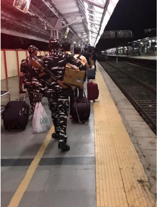
CRPF guard helping students